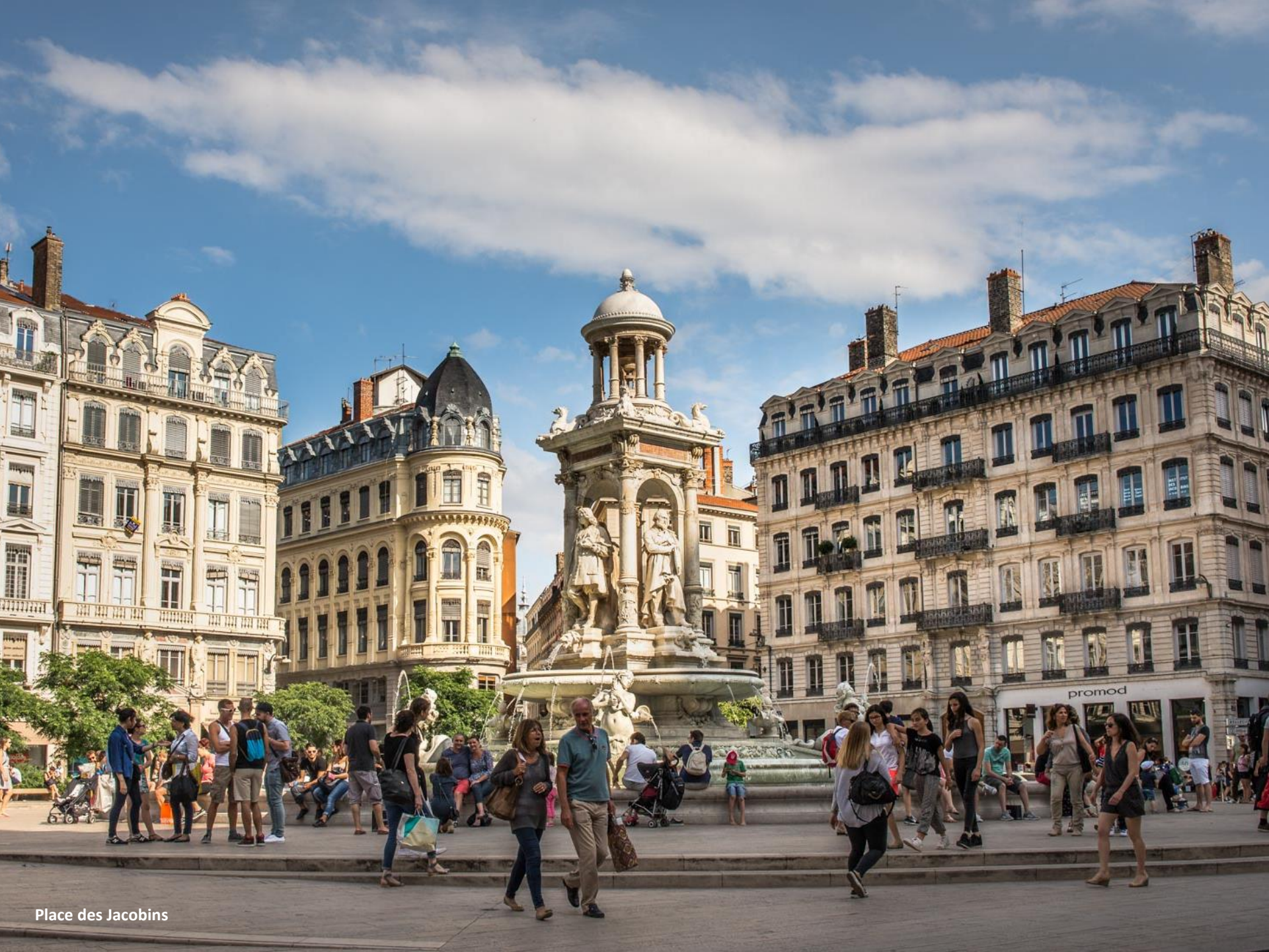
Place des Jacobins